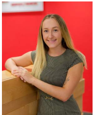
Caitlin Waldron Communications